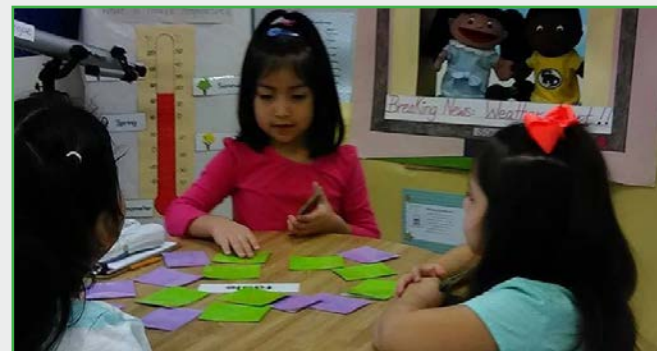
Classroom activity time!