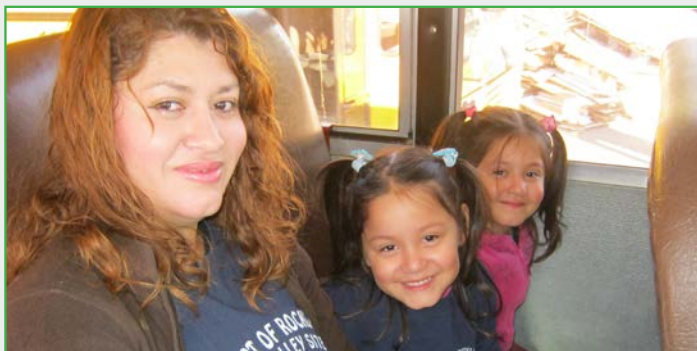
Gearing up for a day of fun activity in Spring Valley