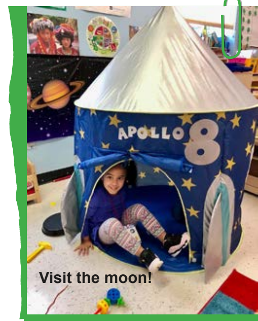
Visit the moon!